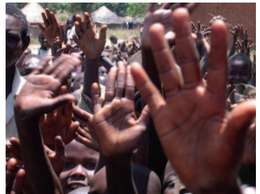
Helping hand? Strengthening aid allocation is a key factor to help deliver the MDGs.

In these discussions, two sorts of disagreement have arisen. One is about principles: what are the fundamental principles according to which aid allocations should be determined? This involves deeper questions about the role of aid and notions of equity and fairness. The