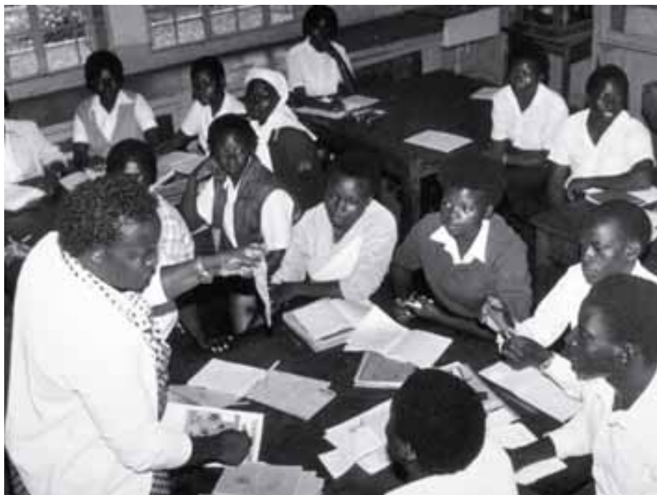
Young people receive a lesson on safe sex.

7. Teachers need support after the initial training. A variety of strategies, including refresher courses, mentoring, and supportive supervision, can help ensure long-term impact from training. Major changes in attitudes and behaviors are not likely to happen in a short period of time.