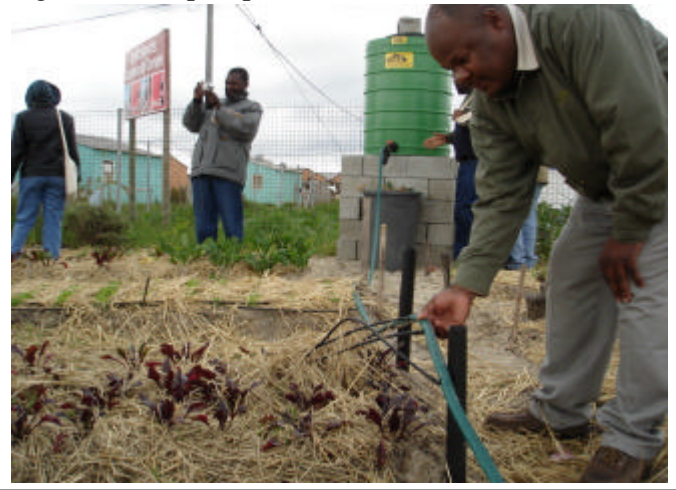
Figure. 1. A drip kit photo

technical efficiency but also recommended the locally assembled kit. The drawback of the local kit was the failure of the local manufacture to meet the required demand.