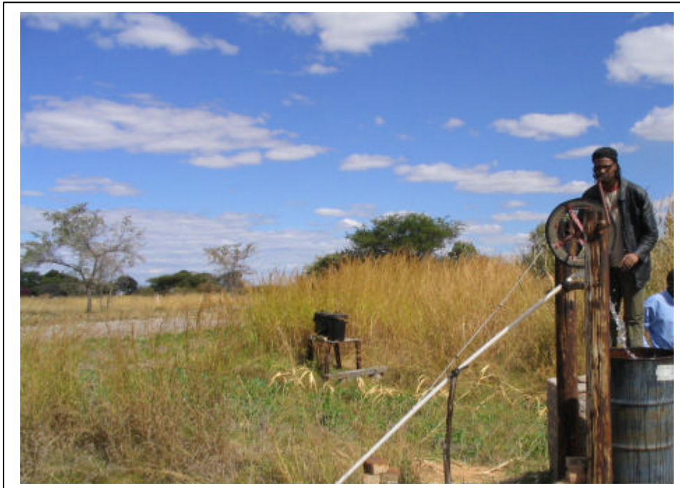
Figure 3. A photo of a rope and washer pump