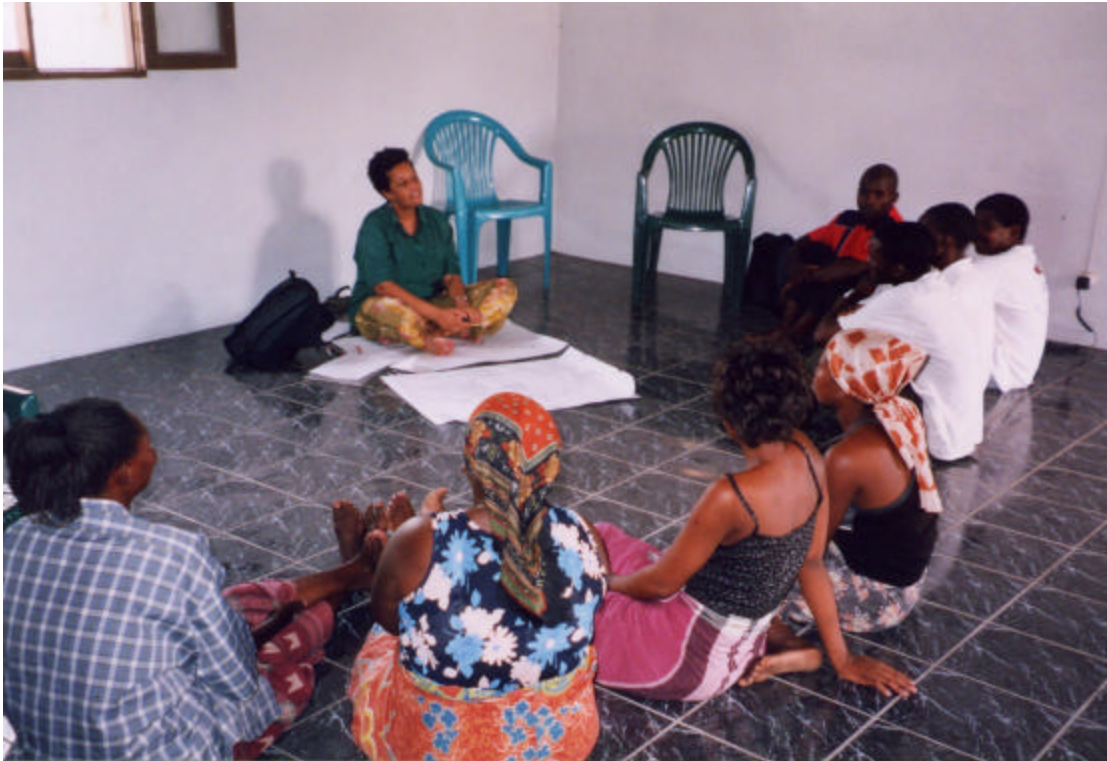
Community survey focus group at Marracuene