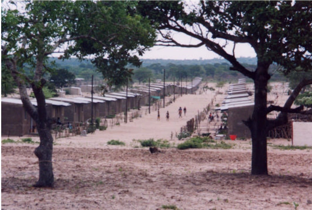
Post-flood resettlement site in Marracuene (Peter Wiles)