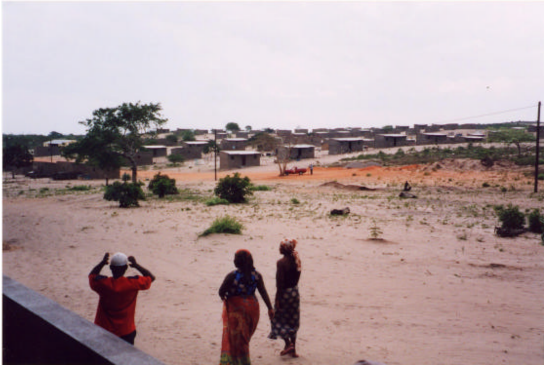
Marracuene resettlement site