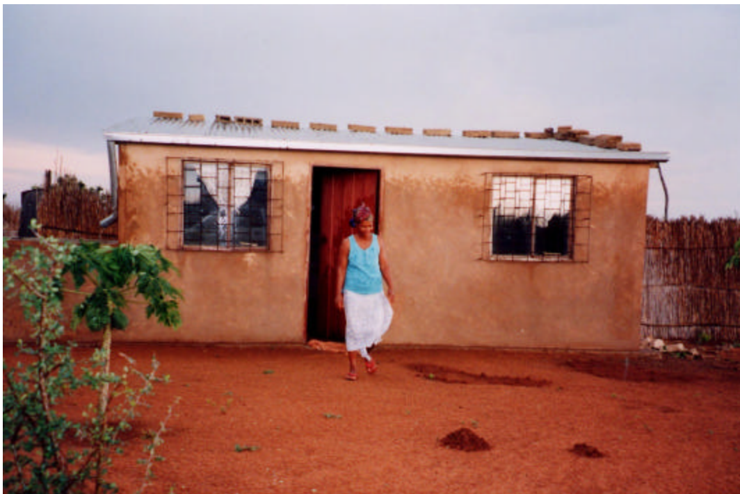
House in Marracuene