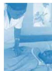
Zimbabwe Millennium Development Goals: 2004 Progress Report

Given these assumptions, annual real increase in expenditure to attain the above defined goals (including 1.1% population increase), health expenditure per child/mother should increase at 3.5% per year. Average spending over the period should increase from the current level of US$ 35.4 per child /mother to US$ 46.4 per child/mother. In parallel, total health spending over the period to 2015 should be US$43.2 mn.