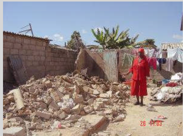
Backyard demolition in Chitungwiza, Harare.