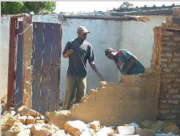
Owners demolishing their own house in Epworth, Harare.