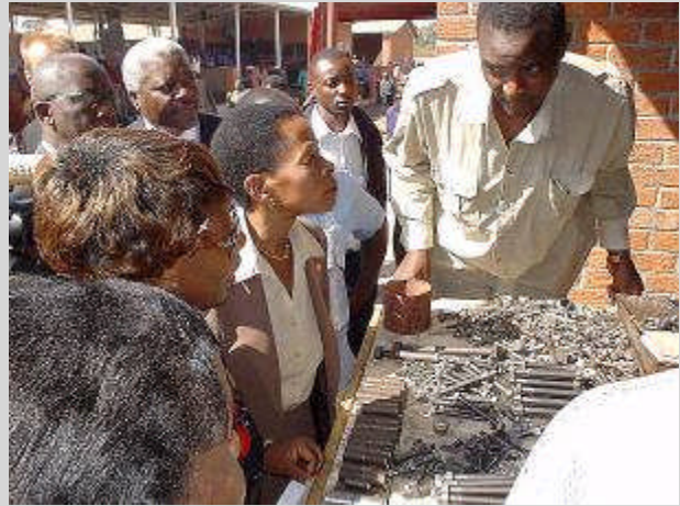
Visiting new stalls for informal traders, Harare.