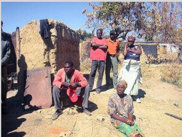
Demolitions outside rural town of Rusape.