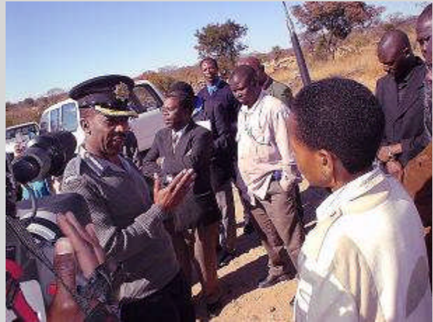
Being briefed about Ngozi demolitions, Bulawayo.