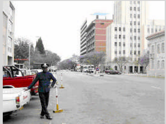
1990's Harare: city of boulevards and clean streets.