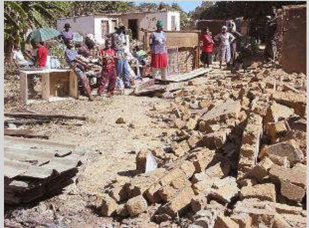
Family Demolishes own house in Epworth, Harare.