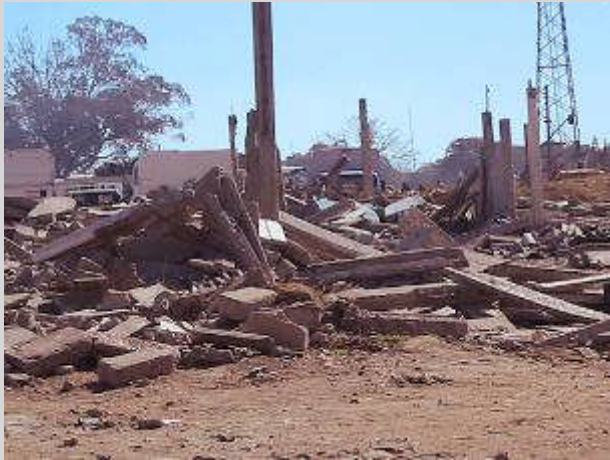
Market stalls demolished in Mbare, Harare.