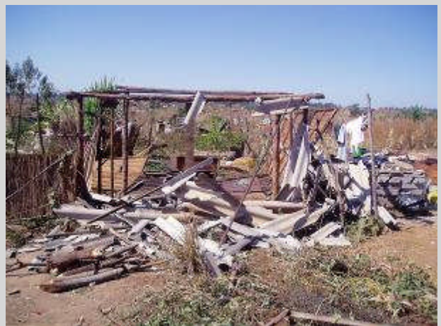
Demolished house at Hatcliffe.