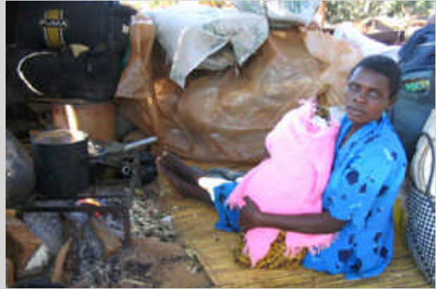
Mother living in the open in Porta Farm, June 30, 2005.