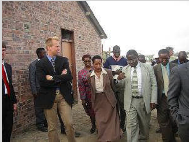
Official launch of Operation Garikai, Whitecliffe.