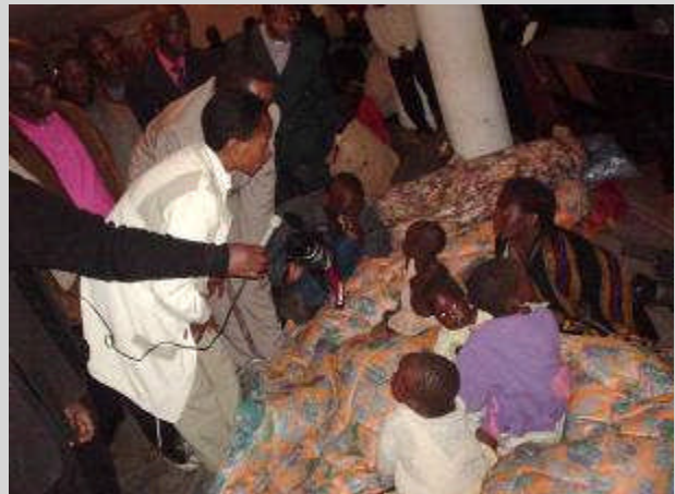
Interviewing families, Agape Mission Church, Bulawayo.