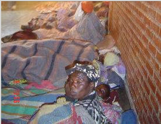
Sheltering in Agape Mission Church, Bulawayo.