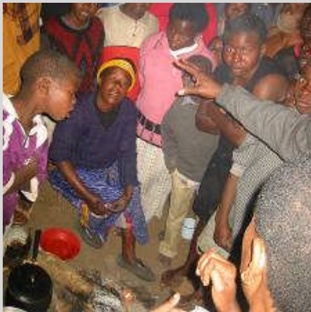
Interviewing woman living in the open, Mutare.