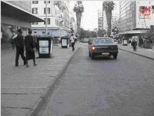
1990's Harare: city of boulevards and clean streets.