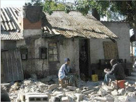
Living amidst the rubble in Mbare.