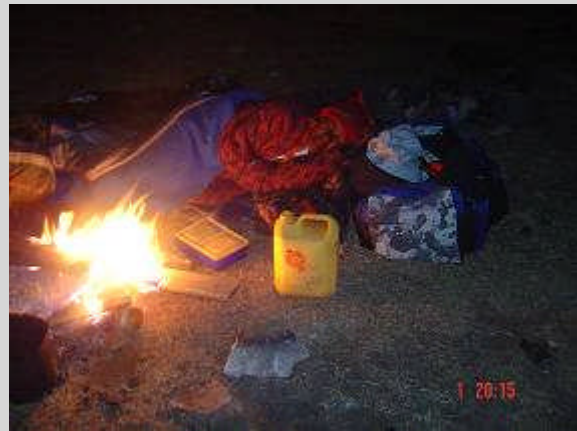
Sleeping out at Sakubva Sports Oval Camp, Mutare.