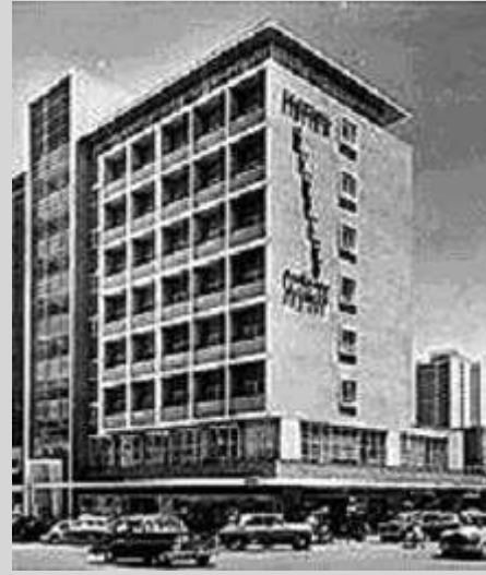
Salisbury: the exclusive colonial city.