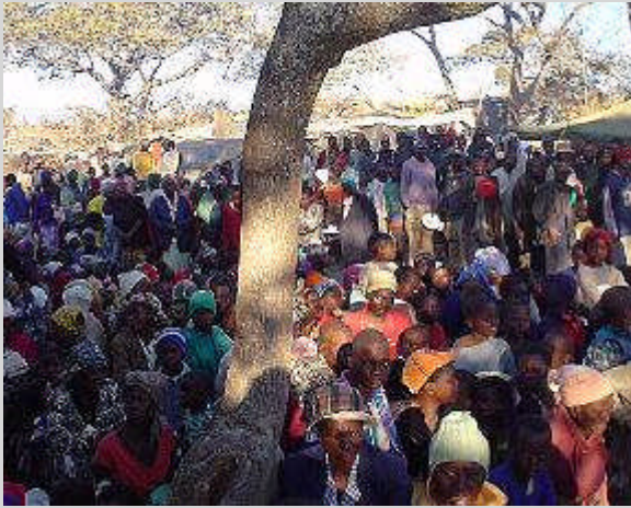
Over 4,000 people in Caledonia Transit Camp.