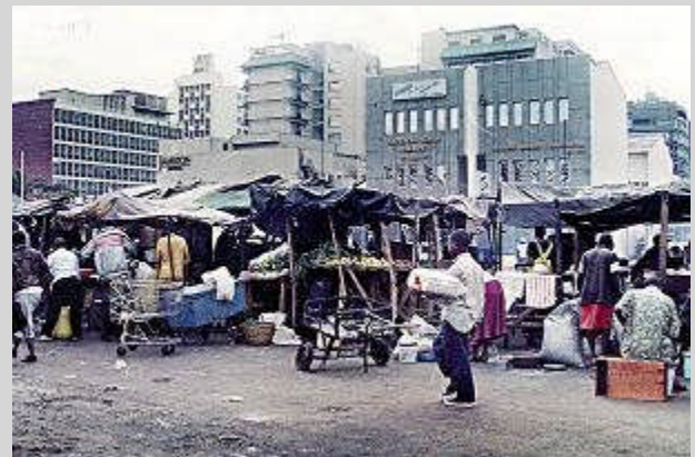
Harare: before Operation Murambatsvina.