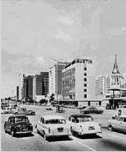
Salisbury: the exclusive colonial city.