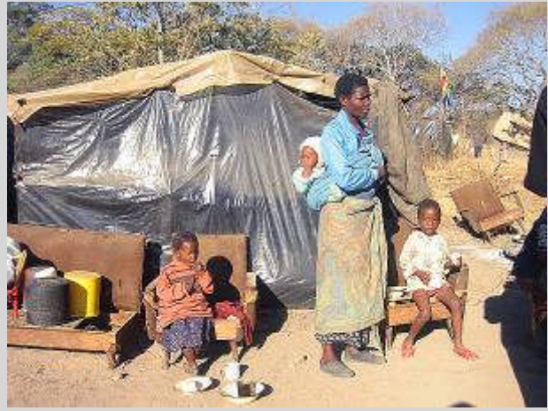
Makeshift shelter in Caledonia Transit Camp.