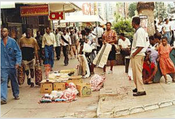
Harare: before Operation Murambatsvina .