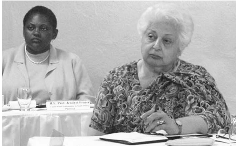
Prof Jendayi Frazer, left, US Ambassador to South Africa, and Dr Frene Ginwala, right, of the Global Coalition for Africa.

In serving as a watchdog over the public interest, civil society also acts as a vehicle for deepening democratic governance. In this role, civil society co-operates with, but sometimes opposes, government measures. Its input in shaping policy gives meaning to popular participation. One of the shortcomings of African governments has been the tendency to shelve good and well-conceived programmes. The contribution of civil society in this regard lies in its ability to pressure governments to follow through on policies to the implementation stage. Civil society's effective watchdog role can, for example, be critical in the way in which it ensures that the SADC Strategic Indicative Plan for the Organ on Politics, Defence and Security Co-operation (SIPO) is implemented.