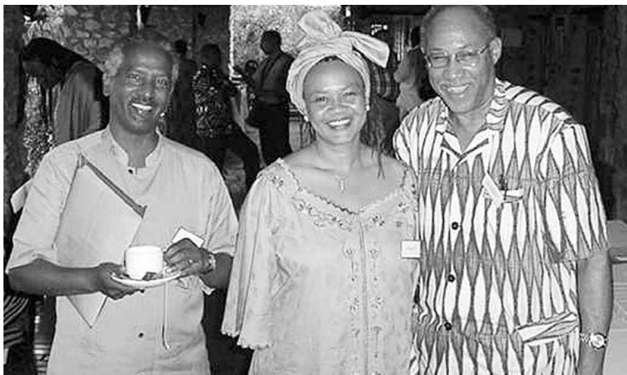
Participants at the AU/NEPAD seminar during a coffee break.

However, despite the opportunities for these new initiatives to contribute to Africa's peace, security and development, the continent's institutions have a number of challenges to overcome. The potential of the AU/NEPAD/CSSDCA structure to accelerate the continent's integration, particularly as it relates to democracy and good governance, is also demonstrated by the redefinition and reshaping of regional organisations such as the Economic Community of West African States (ECOWAS) and the Southern African Development Community (SADC). Member states of these organisations have signed protocols on governance, peace and security, as well as declarations, in the case of SADC, enjoining governments to promote respect for human rights and sound governance practices. Both SADC and ECOWAS member states have passed declarations denouncing unconstitutional changes of government. Regional bodies have also established electoral norms and standards. SADC in particular has made important strides in this direction. During its summit in July 2004, SADC adopted electoral principles, norms and standards that must be met by member countries in the conduct of electoral polls. These standards have since become the basis of opposition agitation for levelling the electoral playing field in Zimbabwe. SADC also promotes popular participation and gender equality.