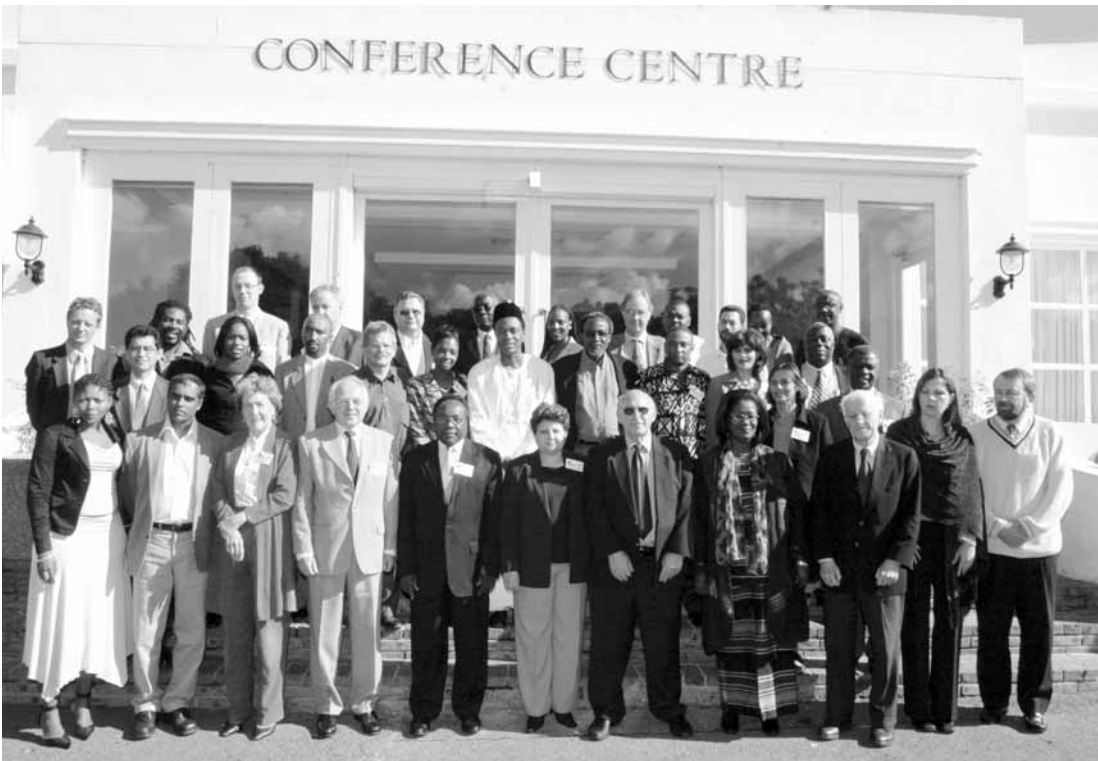
Participants at the seminar, African Perspectives on the UN High-Level Panel Report, A More Secure World: Our Shared Responsibility , Somerset West, Cape Town, 23-24 April 2005